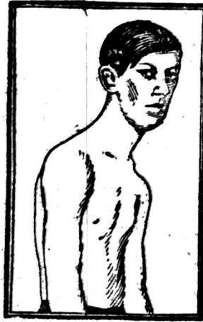
A NERVOUS WRECK

Consultation FREE. Question Blank For Home Treatment sent FREE. Reasonable Fees for Treatment