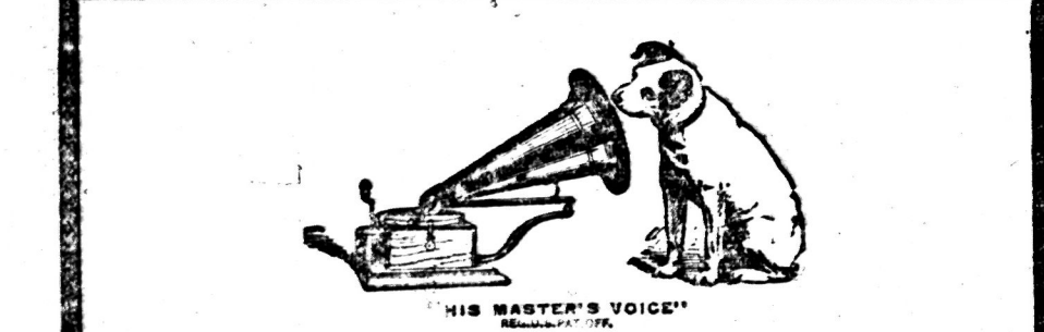
"HIS MASTER'S VOICE"