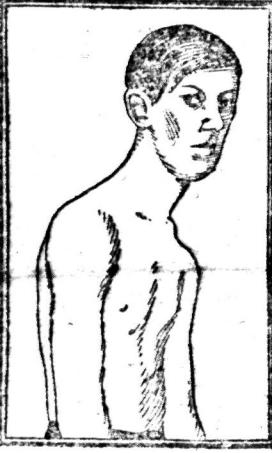
A NERVOUS WRECK

Consultation FREE. Question Blank for Home Treatment sent FREE. Reasonable Fees for Treatment