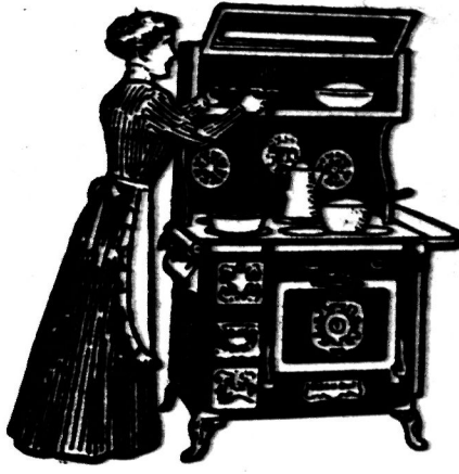
"Made in Canada"

A gas range that can be changed to a coal range in three seconds