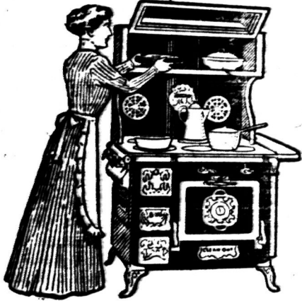
"Made in Canada"

The Champion Interchangeable can be changed from a gas range to a coal or wood range in three seconds. There isn't a single bolt to remove or a screw to turn. The operation is so easy a child can do it.