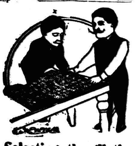
Selecting the Cloth

The report of to-day's session will be published next week.