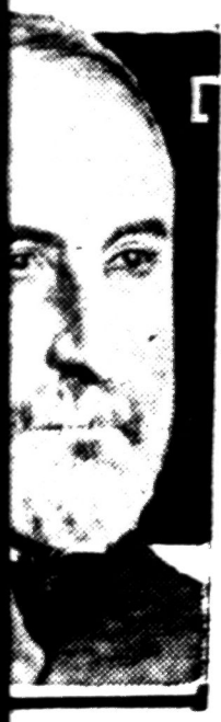
Who Died of Ocean, on the