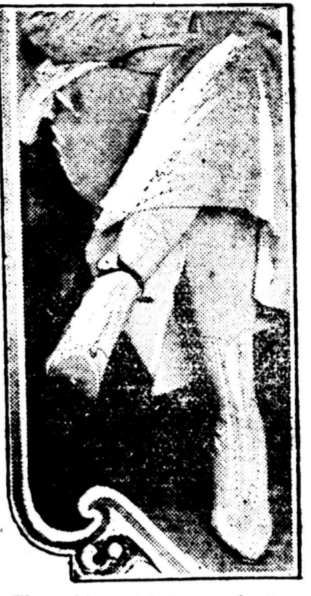
The ankle watch has made its appearance in New York and elsewhere...

Continuation of the story text in the fifth column, starting with 'Things You Ought To Know'.