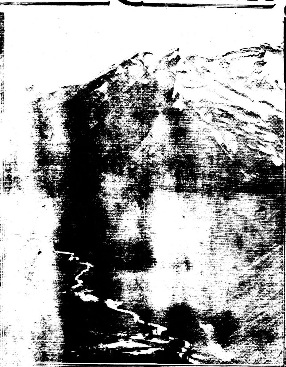
(1) Look-off Point, Cougar Valley, Ontario, B.C. (2) Entrance to Caves of Naamu, Glacier, B.C. (3) Entrance to Caves of Naamu, Glacier, B.C.