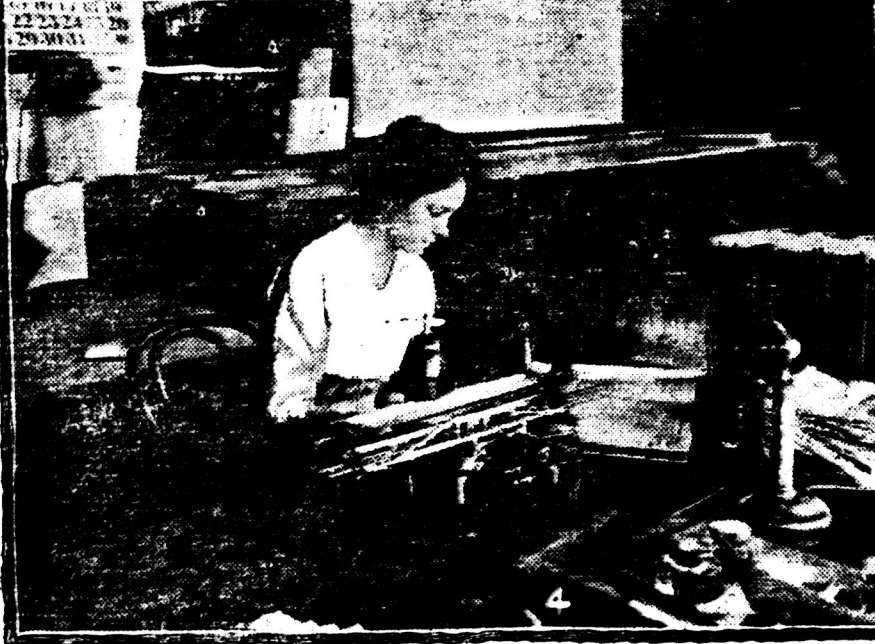
(1) Women Car Cleaners at Work. (2) Turning Fuses. (3) Port McNicoll. (4) Women Workers at Galt.