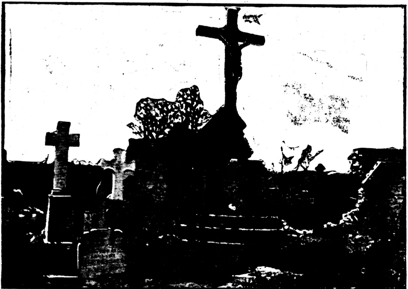
The great British advance in the West.—Yet another instance of a crucifix escaping injury from shells.