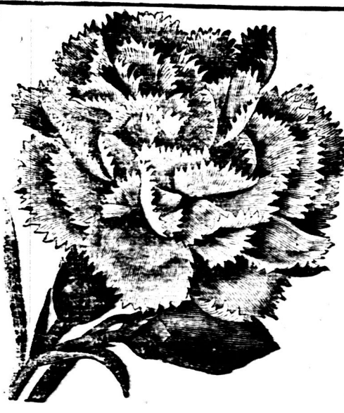
Giant Flowering Carnation

fragrant and the plants do well outdoors. They early fall they bloom profusely from October till the end of May. Extra plants are easily propagated from them by cuttings, "pipings" or layering.