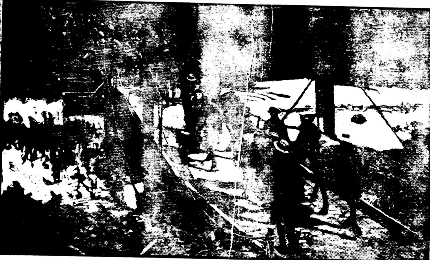
Official photographs—The Battle of Flanders.—Artillery crossing the Yser.