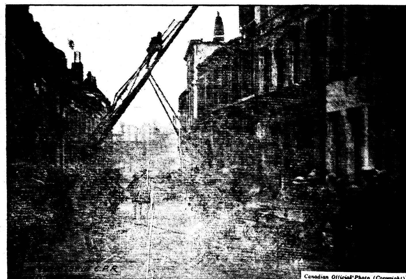
Fighting the fires started by the Germans.