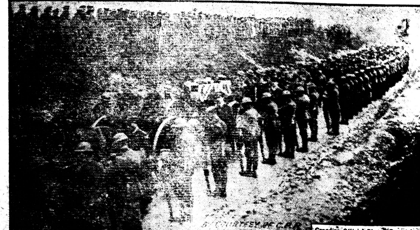
Funeral of General Lipsett near the line. The cortege passing between men of a battalion which the general brought to France. H.R.H. the Prince of Wales following the coffin.