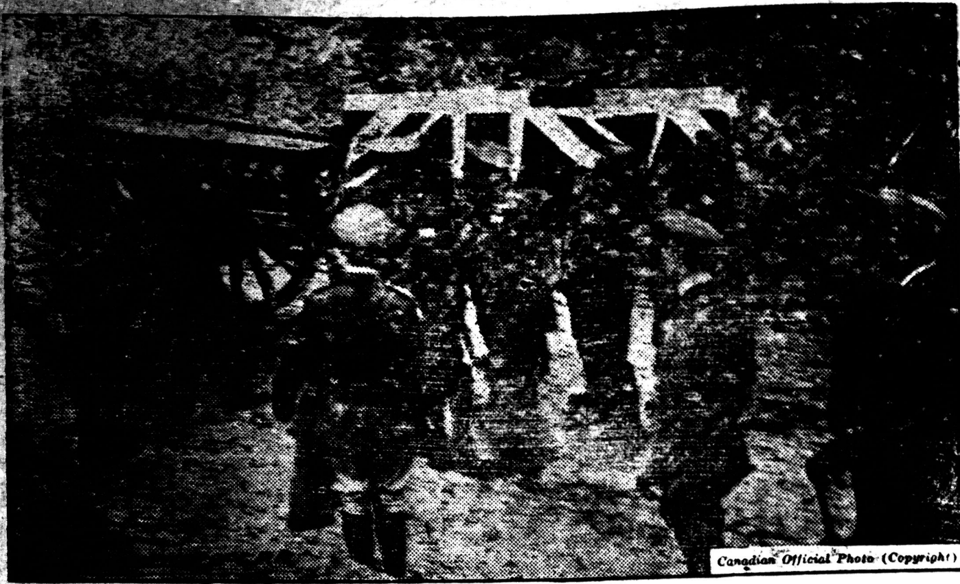
Funeral of General Lipsett near the lines. Taking the coffin from the gun carriage. H.R.H. the Prince of Wales following the coffin.