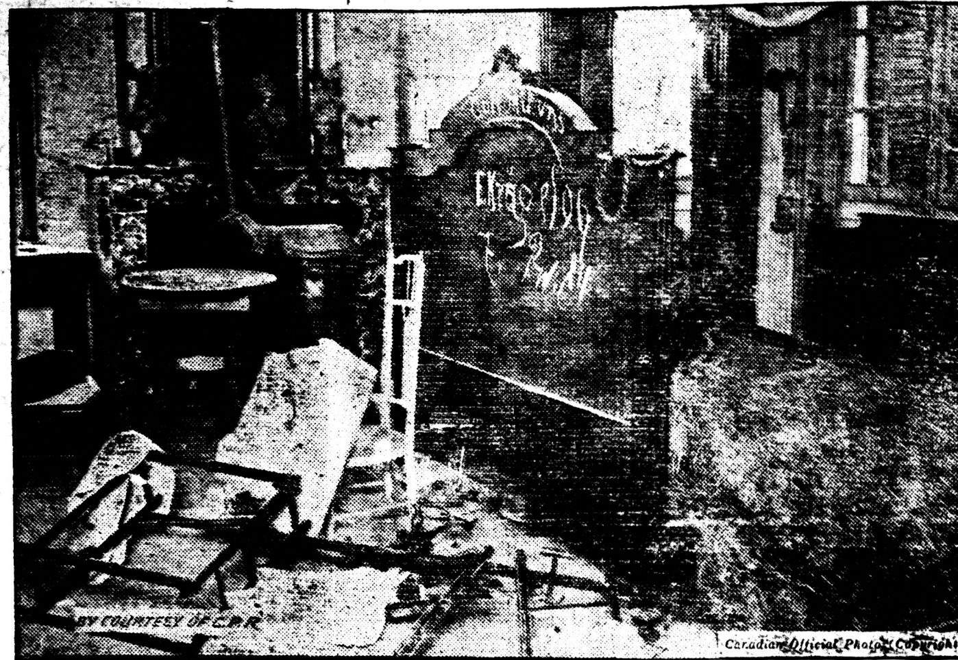
"Get Mit Uns": This German hall mark chalked by one of the Cambrai vandals on the stand of a pillaged room is a good example of German humor.

The statistics show that the cities have the smaller increases in births, while the places other than cities and towns have the larger figures.