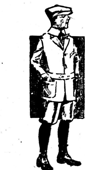
Boys' Suits That You Would Never Hope to Buy For $4.40

There hasn't been as good a Shirt Sale as this in Simcoe for a mighty long time—and a long time coming before such another. Soft and stiff bosoms; sizes to 17½; values up to $1.50. This sale, each, 97c.