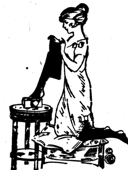
FEBRUARY HOSIERY SALE

Ten dozen only men's fine quality soft Felt Hats, the coming season's newest blocks and colors; a real $3.00 value. This sale, only $1.98 each.