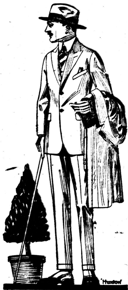
Men's Suits and Overcoats

IT MEANS A FORMER SAVING, IN THE FACT THAT THE ORIGINAL PRICES WERE BELOW THE AVERAGE. IT MEANS A PRESENT SAVING, IN THE FACT THAT THE ORIGINAL PRICES ARE NOW REDUCED. IT MEANS A FUTURE SAVING, IN THE FACT THAT DUPLICATES OF THE MERCHANDISE NEXT SEASON WILL COST MORE THAN THEY EVER HAVE. AND IT MEANS, ALSO, THAT YOU ARE GETTING GOODS WHICH DO NOT DEPEND ON REDUCTIONS FOR THEIR REPUTATION, BUT SELL AT REGULAR PRICES AS FAST AS MOST MERCHANDISE SELLS IN A SALE.