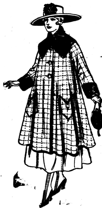
Extraordinary Opportunities in Women's Winter Coats

3. Fine one and rone rib pure cashmere hose in sizes 8½, 9, 9½ and 10; a 75c value. This sale, 58c pair.