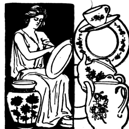
Our Extensive China Store Offers Great Savings

At $19.50—Your choice of coats worth up to $30.00.