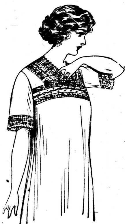
The Sale of Whitewear

Down Comforters, fancy saffron covering, satin border; guaranteed down proof; worth $16.00. This sale each $13.00.