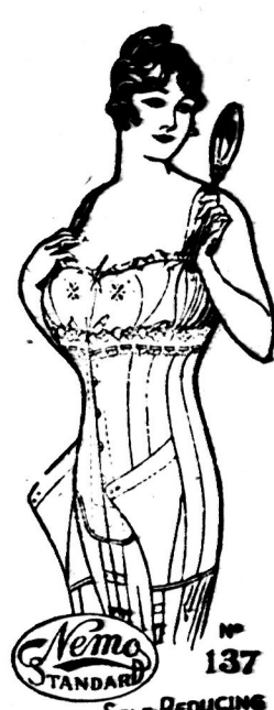
A Demonstration and Sale of Corsets

9 only pure wool Skating Coats, worth $5.00, for $3.25. 39 only men's Sweater Coats, assorted colors, $2.75 value, for $1.68. House Dresses in a variety of desirable colors and styles; regular $1.25 and $1.50. Sale price 98c. Brushed Wool Skating Scarfs, $1 and $1.25 value. On sale at 70c. Boys' extra heavy striped Cottonade Overalls, this sale... 95c pr. Men's extra heavy Wool Ribbed Socks, weight 5½ oz.; regular 75c, for 47c. Shoe Laces, full width and length... 3 pair for 10c. Lead Pencils, two specials... 6 for 5c and 3 for 5c. Embroidery Remnants, 2 in. to 20 in. wide, selling at 8c to 25c yard. Bleached Bath Towels, fine soft quality, each... 9c. Terry Face Cloths, only... 5c each. Curtain Scrims, plain centres with fancy borders, 20c value, 15c yd. 30-inch pure Linen Table Centres, worth 75c, for... 58c. Pure Linen Tray Cloths, 85c value, for... 65c.