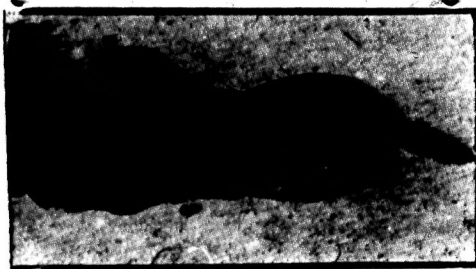
If a Woman Wants Anything in Furs, Now is the Time to Get Them

If conditions make it impossible to produce these Suits and Overcoats today at their original cost to us, what is it going to do to next season's prices, and to you?