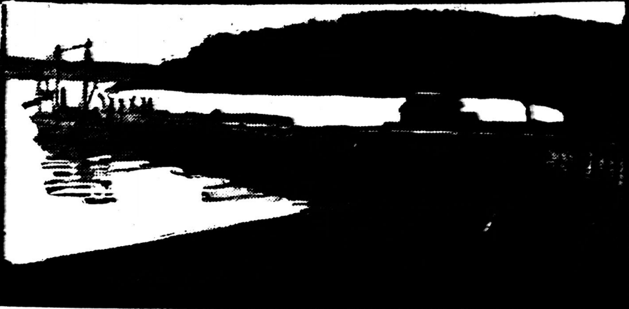
Partridge Island, Parramore, N.S.

And here too the New Englander found a new world. The Acadians, who came to this land in 1604, and who by their gentle breeding and sturdy, her husband and her misfortune built up mighty fortunes which now are the pride of the Acadian community in our history. The Acadians, who came to this land in 1604, and who by their gentle breeding and sturdy, her husband and her misfortune built up mighty fortunes which now are the pride of the Acadian community in our history.