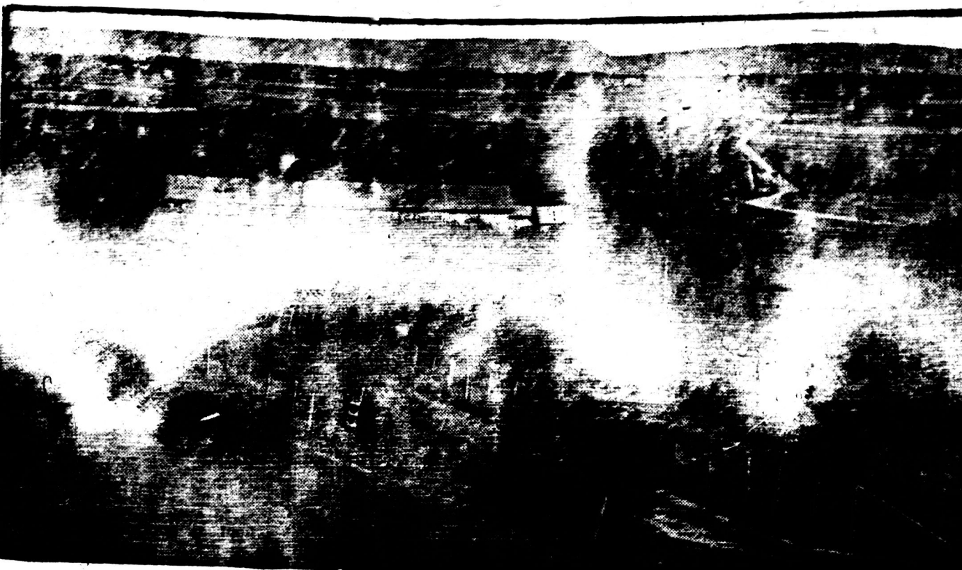
An Acadian Home.

R ICH in its history of strong men and heroic women whose stirring adventures by land and sea set the imagination aflame, appealing in its wild scenery of lakes and streams and wooded hills, charming in the lawns and hedges and shady streets of its villages and towns, the country from Yarmouth to Digby, Nova Scotia is the Mecca of the historian, the sportsman, the painter, the geologist, and the vacation seeker. In this land, which even to-day abounds in rivers and lakes teeming with luscious, leaping fish, and is clothed with forests of fir, pine, hemlock and spruce, home of deer, moose and bear, the Indians must have lived from time immemorial. Such a paradise for the sportsman must have been the subject of song and story among the Indians.