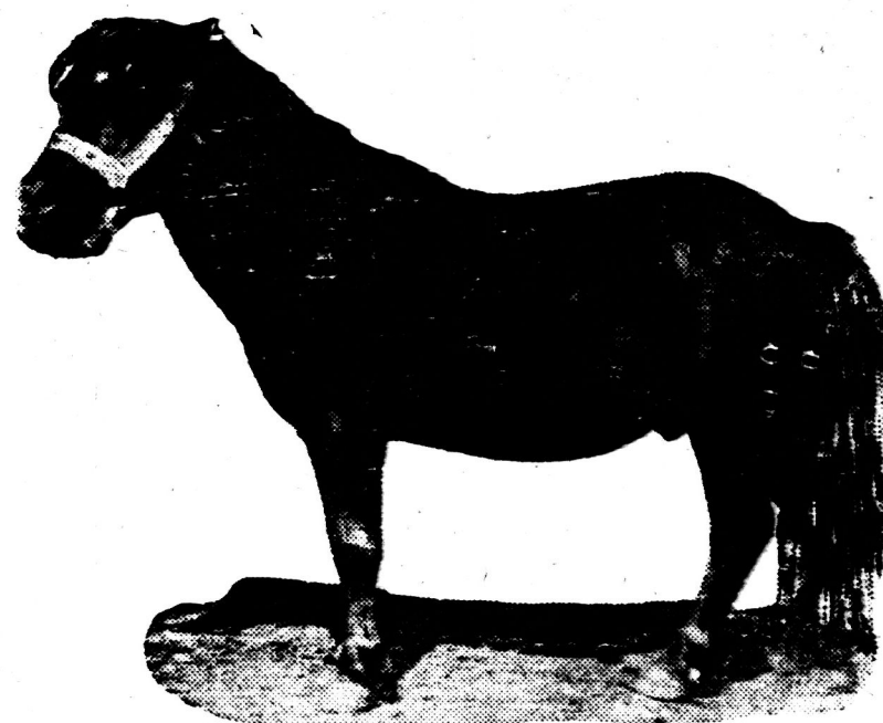
Champion Silver Star of Transy, the head of the herd.