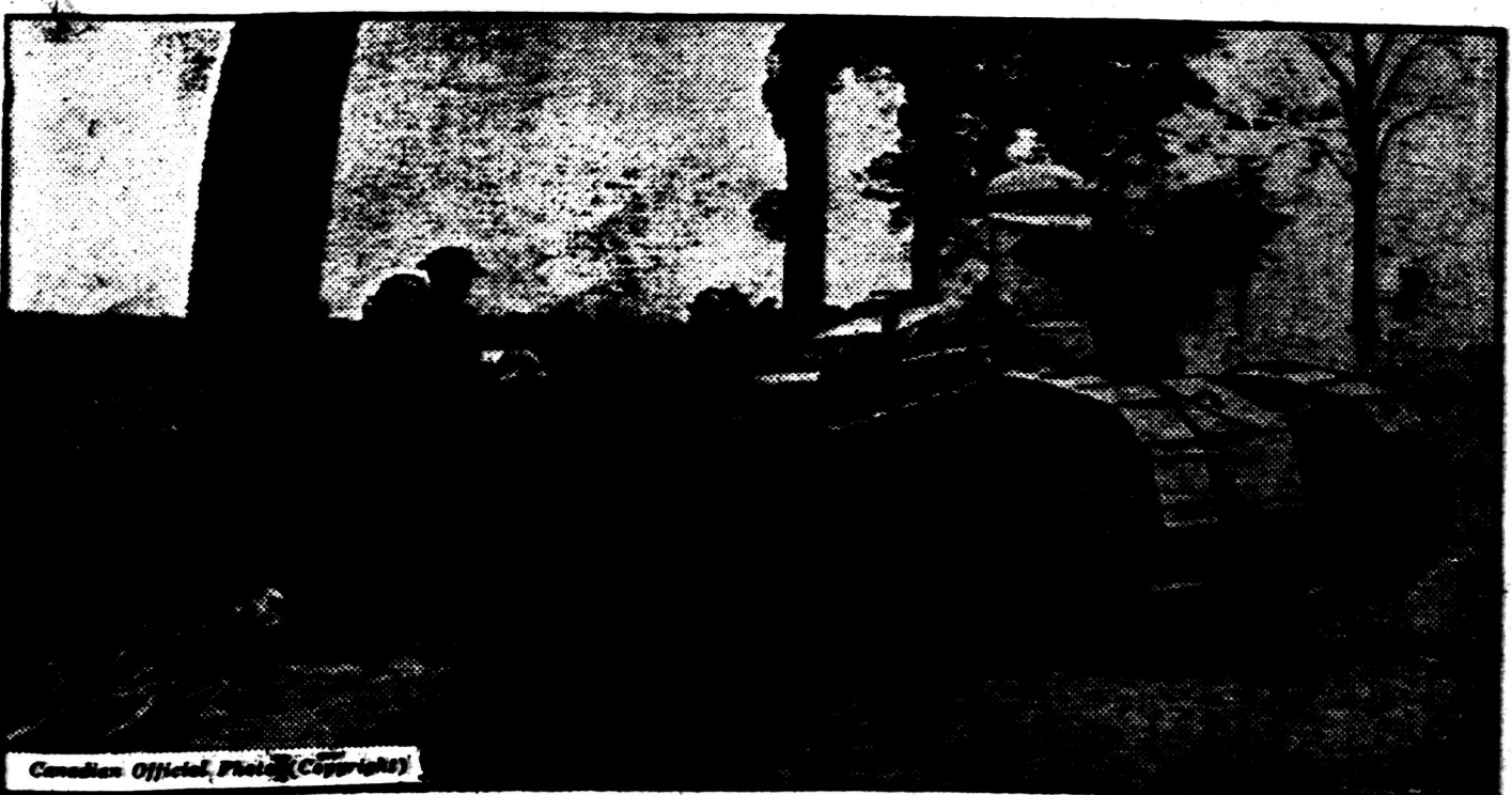
A Canadian Brigadier General in a tank starting on a reconnaissance. He was heavily shelled while passing through what was a few moments before a German stronghold.