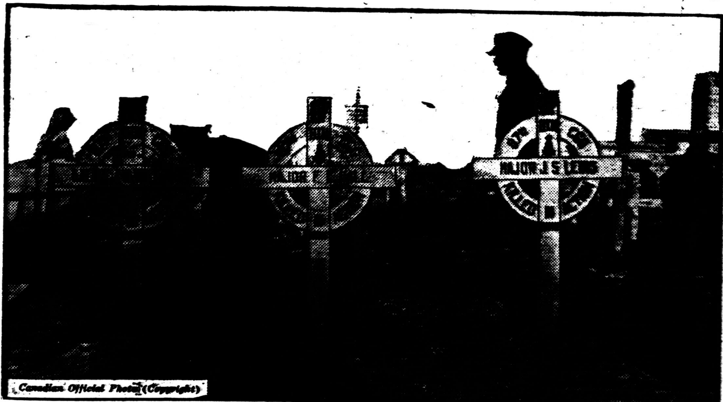
The graveyard at La Boisselle, on the Albert-Bapaume road, shows the graves and simple wooden crosses in memory of three brave officers of the famous 87th Battalion, Canadian Grenadier Guards, all killed the same day.