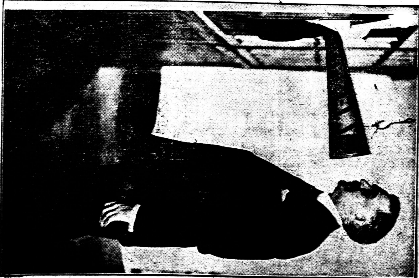
SCIENCE AND INDUSTRY AID VICTORY LOAN

HEAVY WOOL SOLES, sizes 9 1-2, 10, 10 1-2 and 11. Per pair 40c, 50c. and 65c.