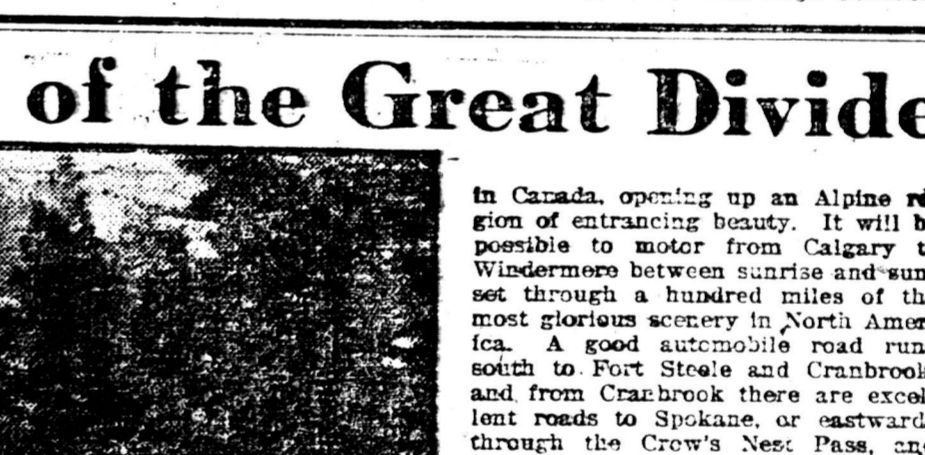
Between Banff, the popular summer resort in the Canadian Pacific Rockies and Lake Windermere, the headwaters of the great Columbia River, lies an Alpine ridge of spectacular beauty, forming part of the Great Divide. This ridge is penetrated by two comparatively easy passes, the Simpson, and the Vermilion which lead into the Valley of the Kootenay River, a region abundant in game on account of its being well south of the main line of the Canadian Pacific Railway.