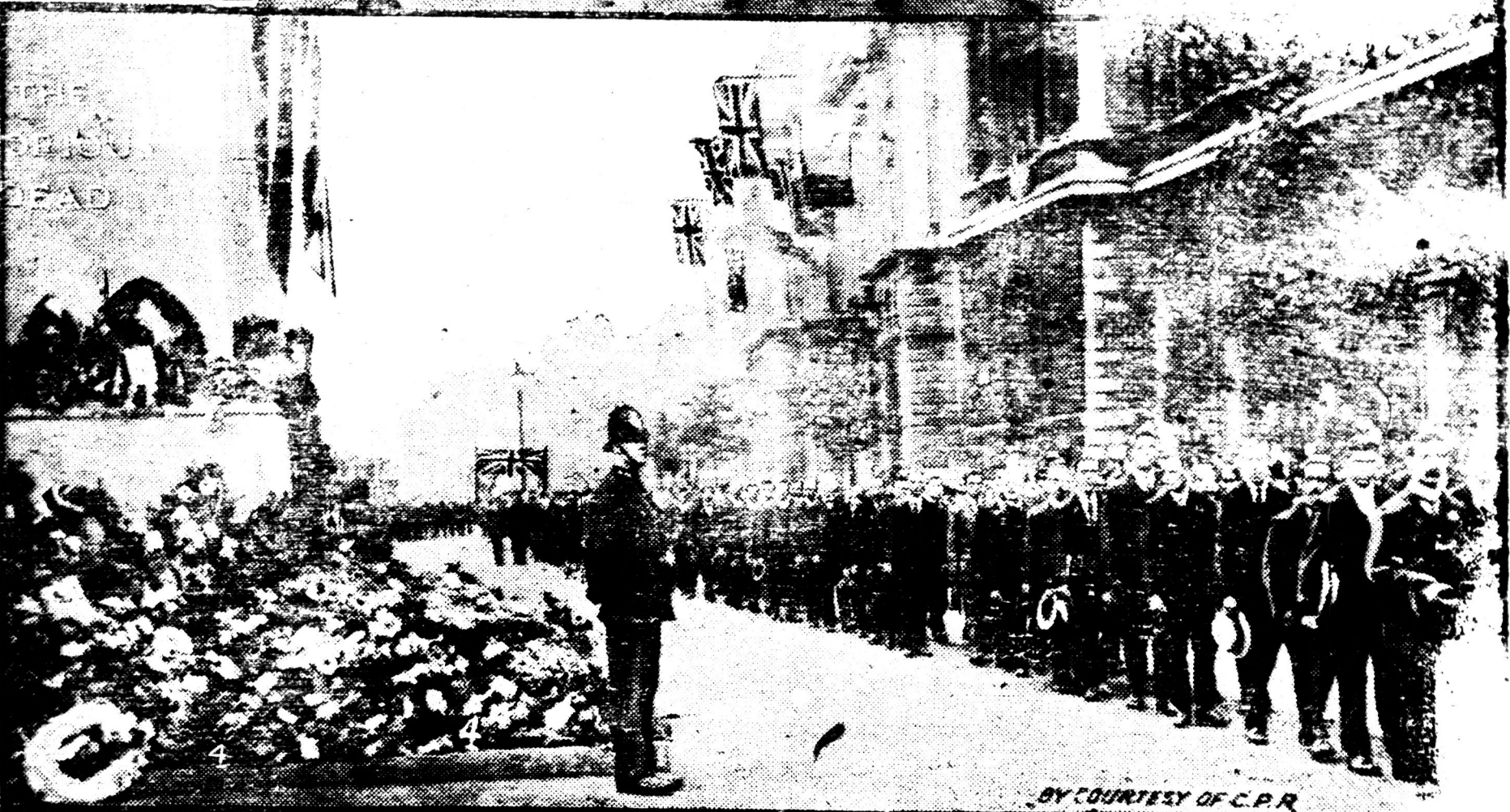
(6) March of the 50,000 ex-Service men in Hyde Park.