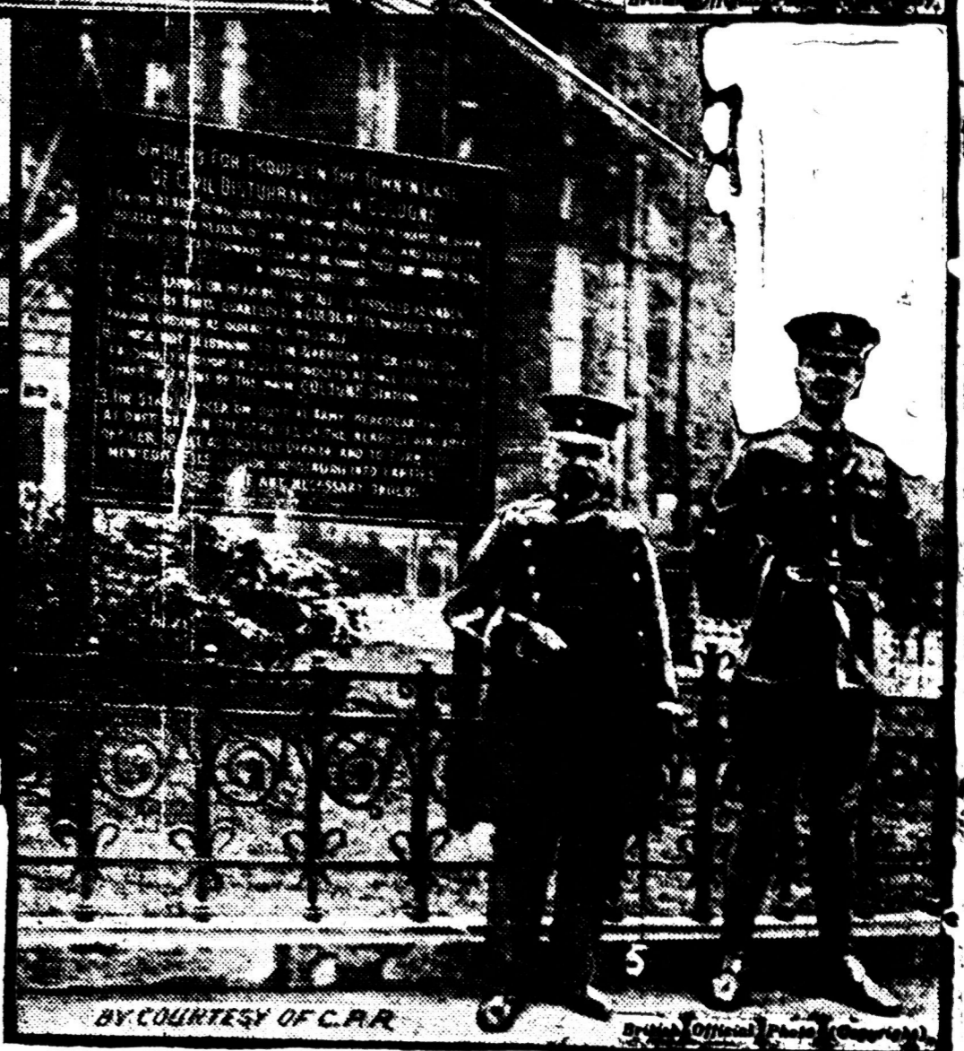
(1)—Tomnies at Cologne on the banks of the Rhine. (2)—Some Cologne Gunners with a stack of cordite which they are about to burn. (3)—The sealing up of rifles on-board the steamer through Dutch waters. (4)—Wrecked boat which was blown up whilst taking in petrol at Cologne. (5)—A notice which is being shown outside the Cathedral, Cologne. (6)—Soldiers enjoyed fishing on the White Sea. (7)—Gen. Sir H. Plumer and Gen. Sir W. Robertson visit the navy on the Rhine.