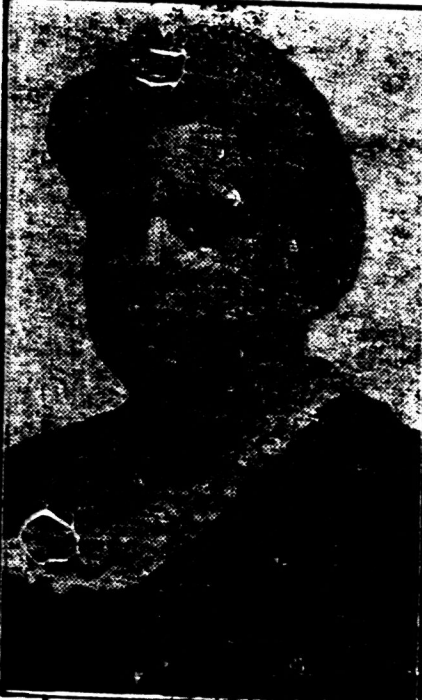
DR. ANNA HOWARD SHAW, Honorary President of the National American Woman Suffrage Association, who died at her home in Koylan, Pa., on Wednesday night. She was 71 years old.

Shipbuilders in Maine are bringing timber for supplying their yards from Oregon. This, a few years ago, would have been regarded as another instance of carrying coals to Newcastle. Time was when Maine had timber enough for its own purposes and to spare. There is, perhaps, no occasion for alarm at the present time, but for Maine to begin thinking of conserving soil of the Aroostook? To have to go out of the state for timber is sad, but to have to look elsewhere for potatoes would be terrible.—Christian Science Monitor.