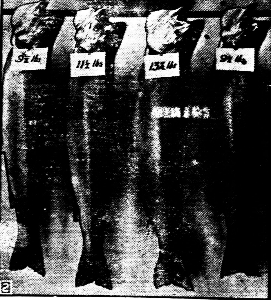
Landlocked salmon caught in Premier Lake, British Columbia, on May 15th, 1918.

THE rivers and lakes in the vicinity of Cranbrook, British Columbia, on the Crow's Nest line of the Canadian Pacific Railway, are happy and prolific haunts for lovers of fishing. All these waters are well stocked with mountain or cut throat trout, rainbow trout, Dolly Varden trout, bull trout, landlocked salmon or Kamloops trout. Excellent catches are made in the fishing season. Foremost amongst the fishing waters of this region are: St. Mary's Lake and river, Kootenay River, Moyie Lake and river, Gold Creek, Cherry Creek, Perry Creek Lake, Boyie's Lake, and Frontier Lake. Perhaps the favorite rendezvous is Premier Lake. This lake is situated about thirty-eight miles from Cranbrook. It is three and a half miles long and one mile wide. Mountains surround it on every side, and it is very deep. There is no visible outlet for the waters. Springs that rise adjacent to the lake and streams from the mountain sides rush to rest in its placid bed. On August 15th, 1915, the Game Conservation Board of the Eastern District of British Columbia furnished Premier Lake, along the Kootenay Central Railway, a branch of the C. P. R., with 10,000 Kamloops trout fry, each one then being about three-quarters of an inch long. A prophecy was made that the fry within four years would develop into fish weighing between twelve and thirty pounds. The accompanying illustration shows some of the fish caught when three years old.