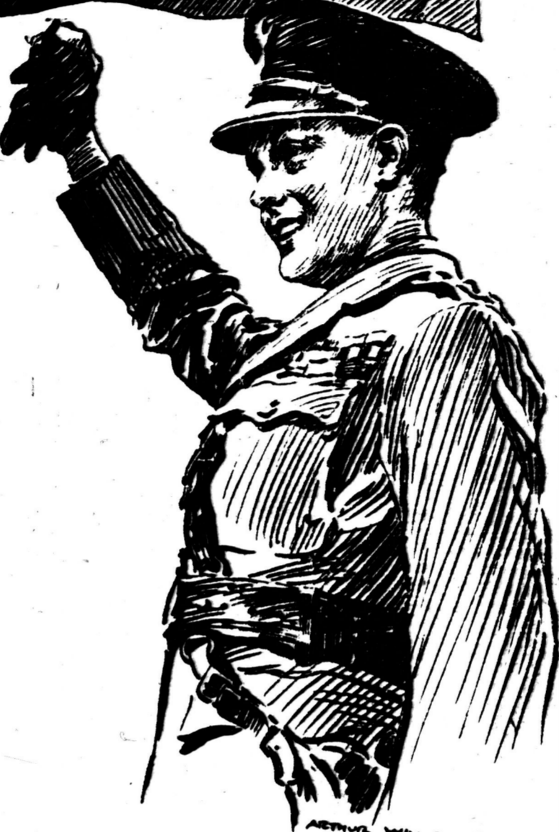
the three ostrich plumes—is shown at the top of the coat of arms.

Anticipating that many districts will buy far beyond their allotment, the organization decided that for each twenty-five per cent. excess of the quota one Prince of Wales' Crest be awarded. Thus the workers in a district doubling its quota will be the proud winners of four small crests for their Honour Flag. These crests will be sewn to the flag. The Prince's Crest—