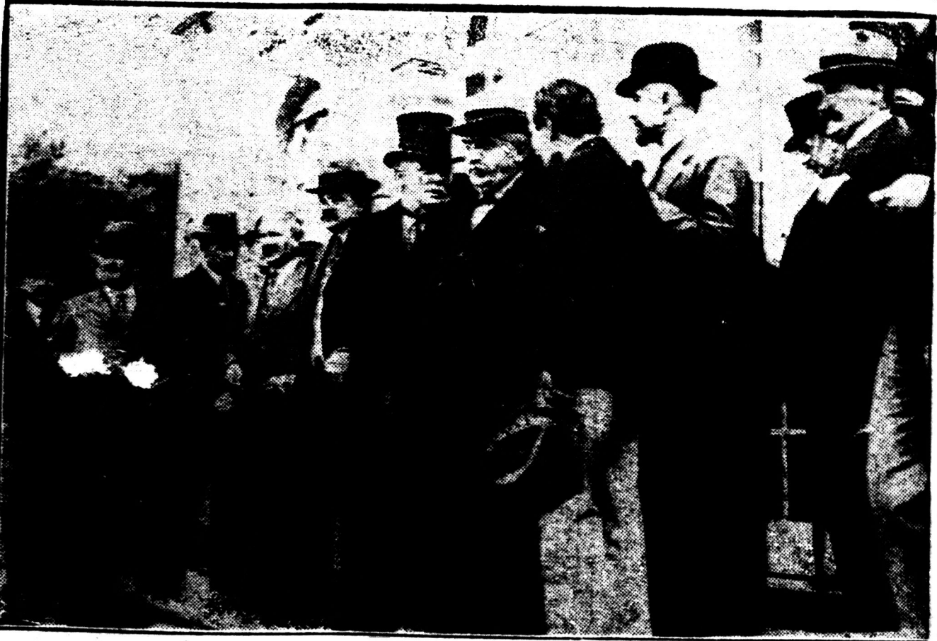
ALLIED DELEGATES AT SPA. A group of allied delegates photographed at Spa during the recent conference with Germany. Premier Lloyd George may be distinguished by his silk hat.

The French military mission reports that munitions might be unloaded for the Polish front at the Port of Putzig, but that their transport through Danzig, which would be necessary, might also be prohibited.