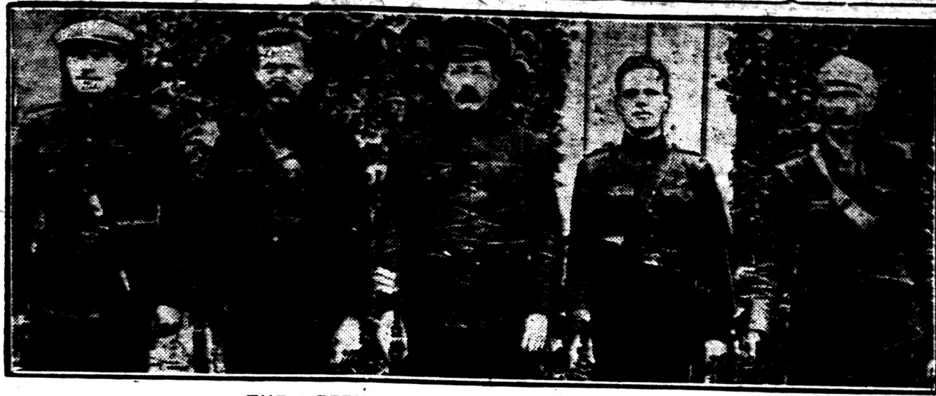
THE DEFENDERS OF KILMALLOCK BARRACKS.