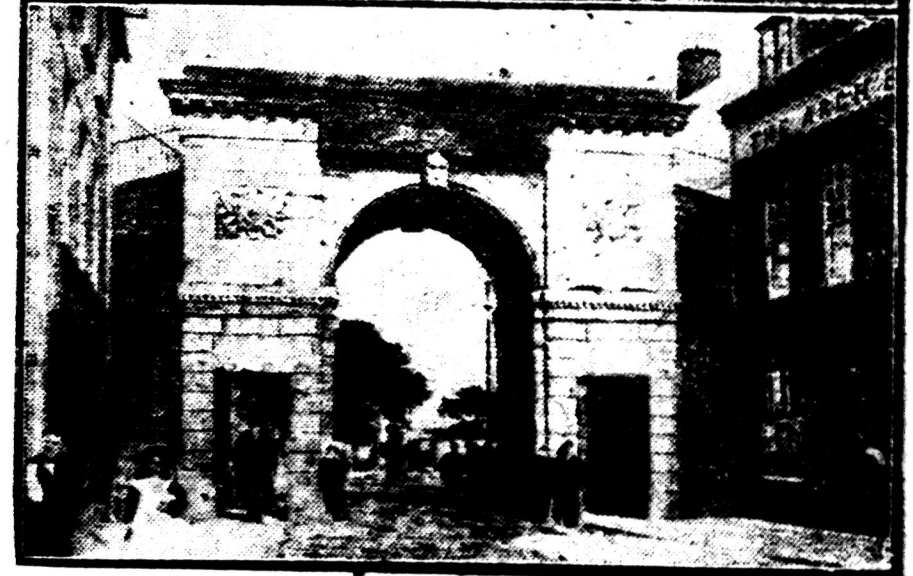
SCENES OF BLOODSHED IN DERRY.

Above are pictures of Bishop's street (top) and Bishop's Gate, Londonderry, where sanguinary fighting took place.