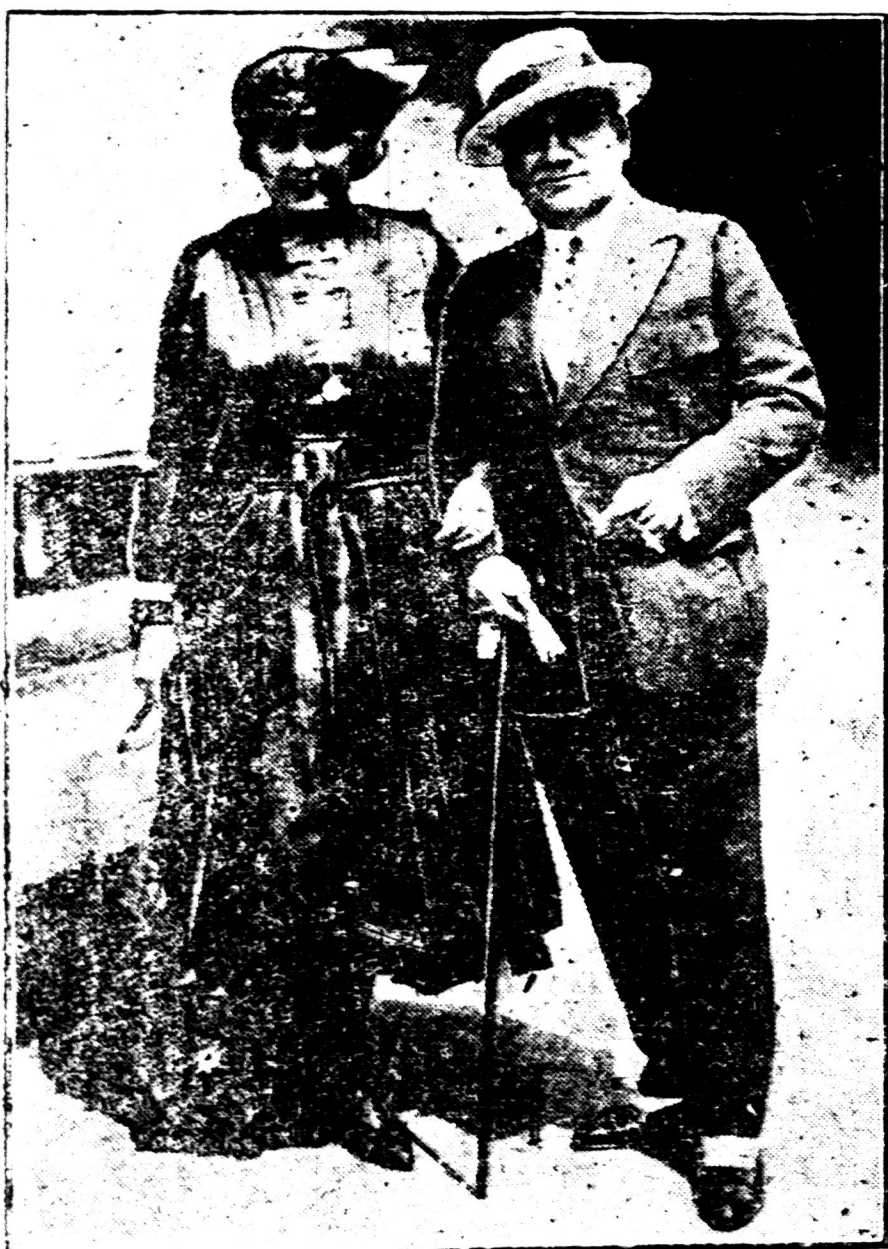
LOST JEWELS WORTH $400,000.