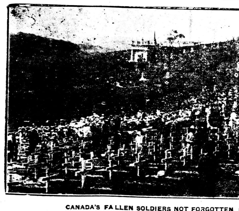
CANADA'S FALLEN SOLDIERS NOT FORGOTTEN IN ENGLAND. This picture shows the touching scene at Shorncliffe Cemetery, when, on June 9th, the children of the Folkestone Hythe, Sandgate, Cheriton, and Shorncliffe schools placed flowers on the graves of the Canadian soldiers there.

Processions of short-trousered students and uniformed recruits to-day marched beside clerks and middle-aged men from the shops and fields. The marchers went through the streets singing patriotic songs, and