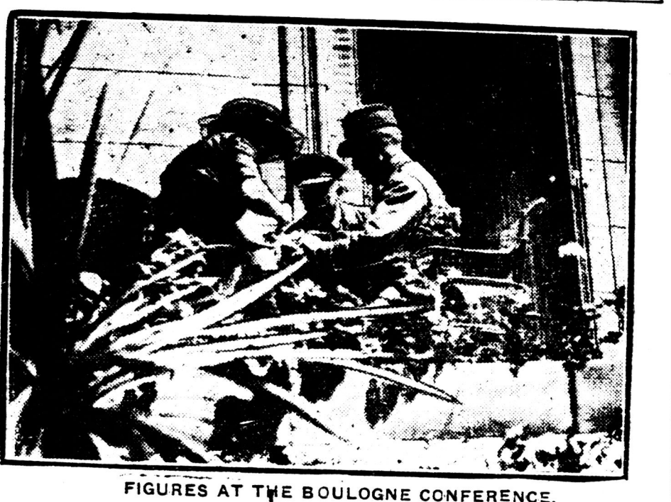
FIGURES AT THE BOULOGNE CONFERENCE. The picture shows Marshal Foch (right) and Sir Henry Wilson, giving their autographs to the wife of a Mayor of Boulogne.

London cable says: Premier Lloyd George, addressing the House of Commons to-day said the Soviet's answer to the Allies regarding peace with Poland was incoherent, ambiguous, and propaganda largely intended for home consumption. So far as he could understand, however, the Soviet Government indicated its willingness to negotiate direct with Poland. The Premier asserted that an independent Poland was essential to the whole fabric of peace, and that the Allies were resolved that they must arrest the destruction of Poland and the march of Bolshevik armies through Polish territory. If the Bolshevik over-ran Poland they would be up against the German frontier, and Mr. Lloyd George said this would furnish Germany a great temptation, with her millions of trained men. It would be a cheap way, according to the Premier, for Germany to get out of her obligations. "I only ask the members to think whether it might not have the effect of depriving the Allies of the fruits of the dearly-bought victory," Mr. Lloyd George added.