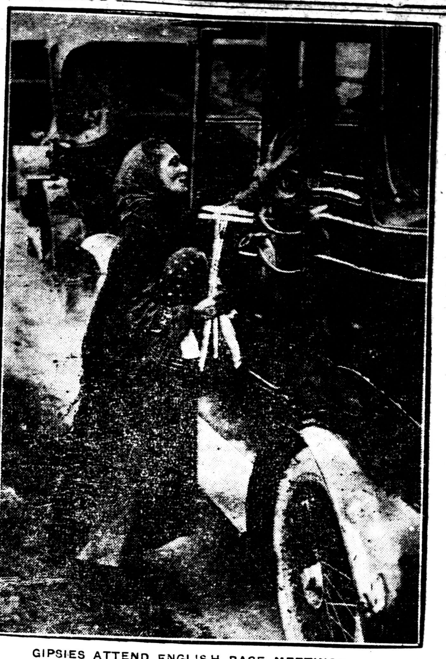
GIPSIES ATTEND ENGLISH RACE MEETINGS. The picture shows a gypsy begging from the occupants of a motor car attending the Epsom races.

15. Saul's disobedience. The present history permits us to look more deeply into Saul's character than we have yet done.