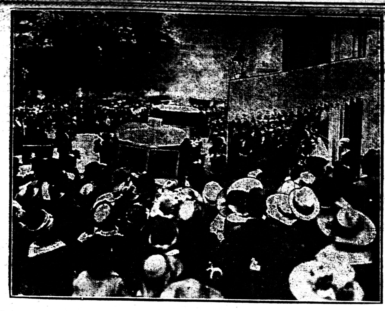
HOW THEY THRONG TO FASHIONABLE WEDDINGS IN LONDON. Terrace, London, for the wedding of Lord Curzon's daughter, which was attended by Queen Mary and others of the Royal family and many notables.

Ulsterites Surprised the Sinn Feiners. Belfast, June —A pitched battle, resulting in numerous casualties, was fought last night in the village of Listellaw, near Enniskillen, when a patrol of Ulster volunteers surprised 50 raiders who evidently were about to burn the court house. Two of the Ulster men were wounded, one of them being shot through the lung. The raiders' casualties are estimated at seven. These men were carried off by their comrades. Inflammable material was found outside the court house by a military detachment which arrived after the flight of the raiders.