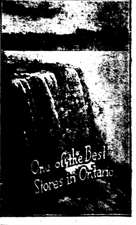
One of the Best Stores in Ontario