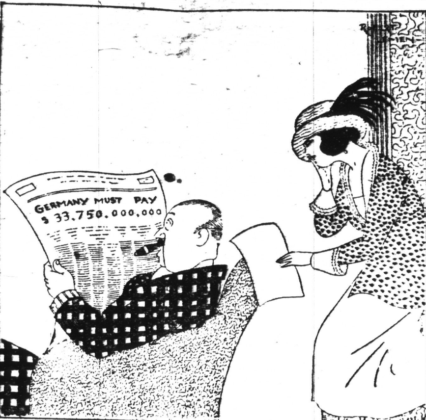
Mrs. Jones selects a good time to present the bill for her new hat.

Grass is afflicted with a parasite which is apt to cause internal trouble among those who have the habit of chewing blades of grass during games, etc.