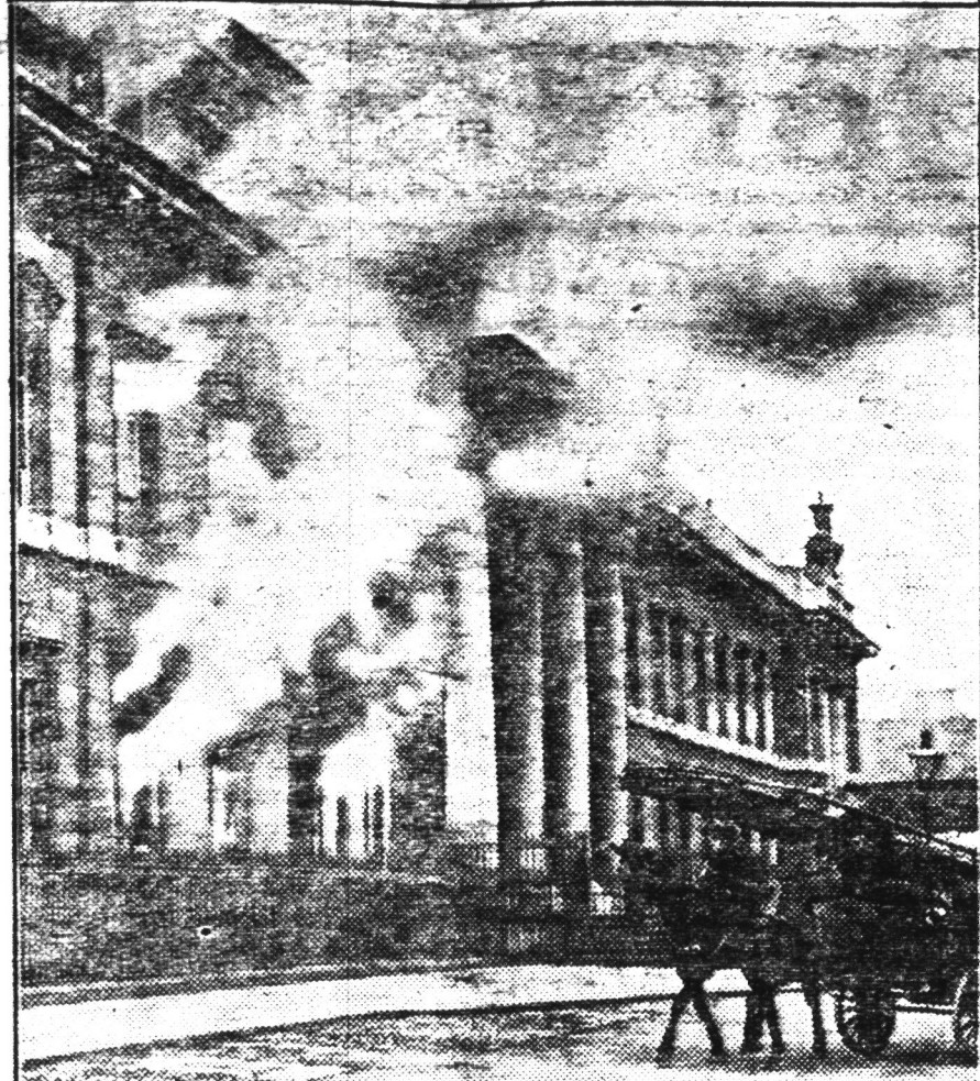
THE WORK OF THE SINN FEIN The picture shows the Dublin Customs House burning just as the fire fighters arrived. Sinn Fein forces seized the building, poured petrol on the papers and floors and then fired it.

and microbes in order to make possible the fixation of the bacillus of foot and mouth disease which is so infinitesimal, that it could not be retained in the most minute filters. Once this was accomplished, it would be possible to cultivate the germ. Fixation now has been accomplished, and the serum has been made in small quantities through a phagocytic process.