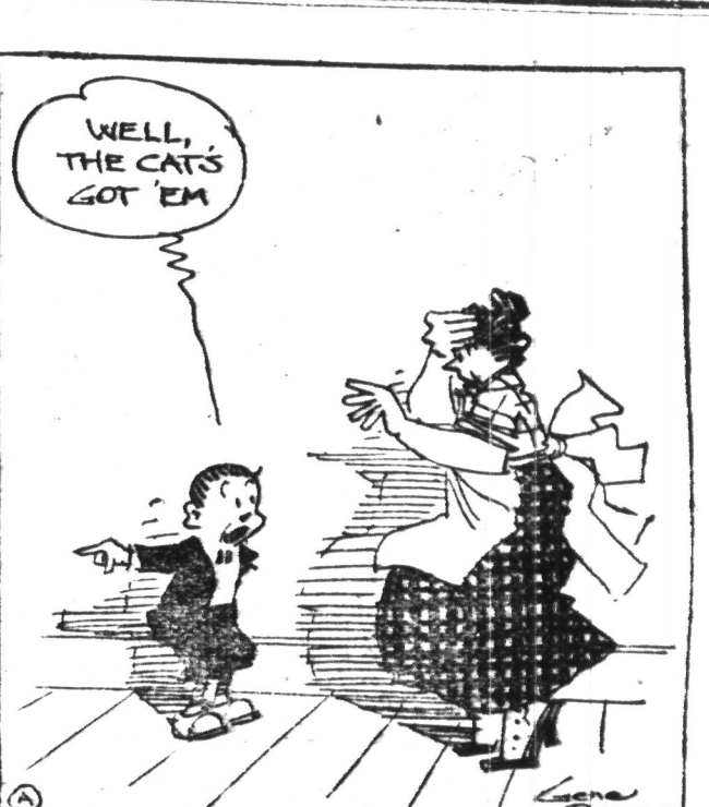
REGULAR FELLERS—By Gene Byrnes