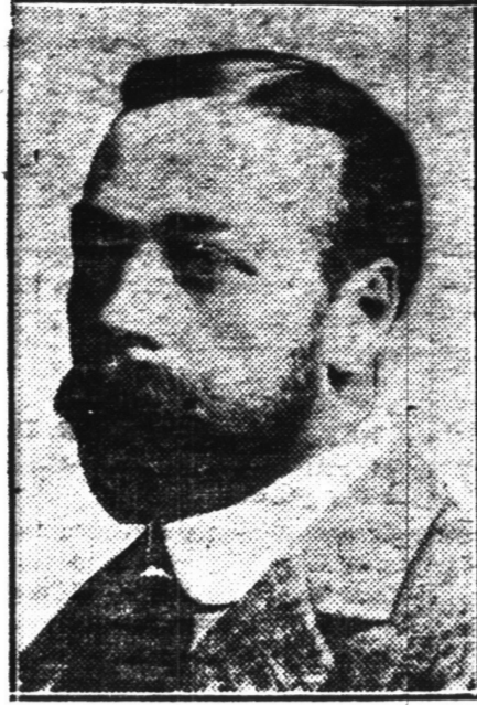
His Majesty King George V who inaugurated the Northern Parliament on June 22. This is the first Irish Parliament to sit in 121 years.

Coast guard and sentinel, watch of the west Of a nation she keeps; But her hand is encased in a gauntlet of steel And her thunder but sleeps.