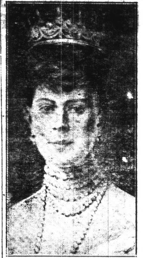
Her Majesty Queen Mary

We'll stand by the dear old flag, boys, Whatever be said or done, Though the shot comes fast, as we face the blast, And the foe be ten to one; Though our only reward be the thrust of a sword And a bullet in heart or brain, What matters one gone if the flag floats on And Britain be Lord of the main. —Frederick George Scott.