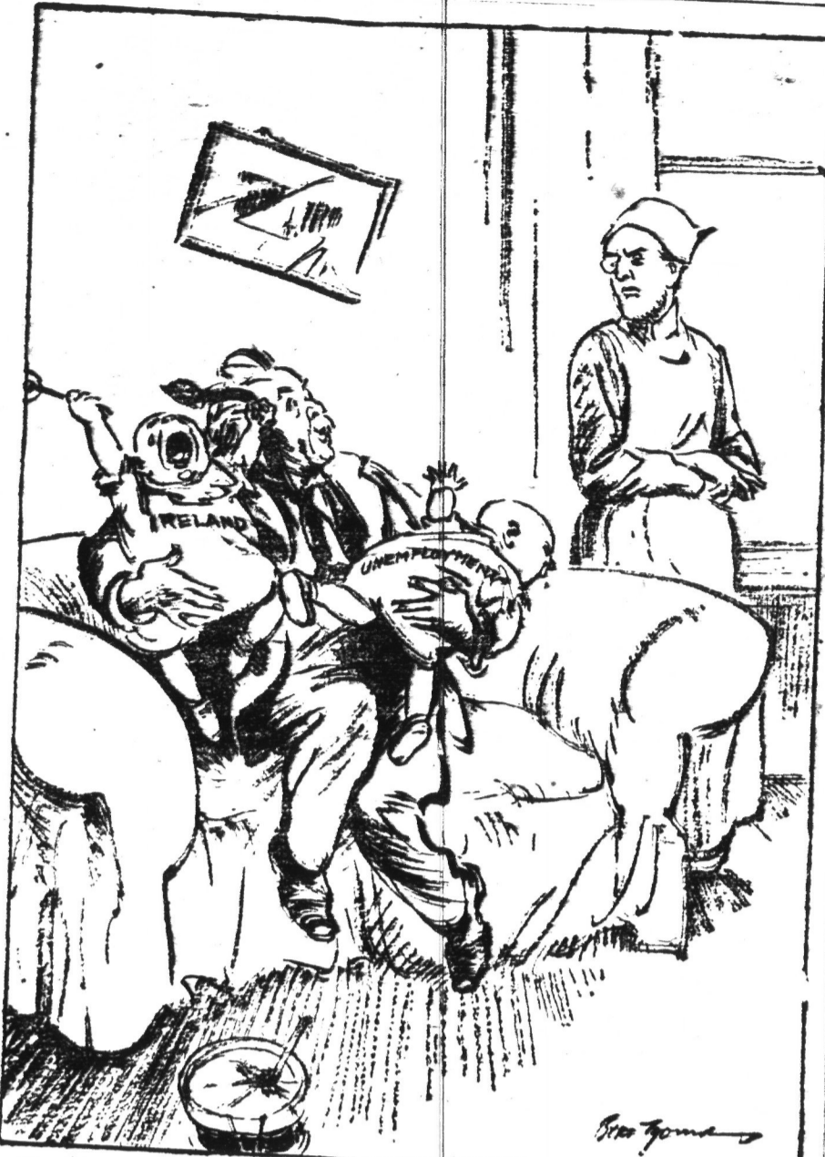
Mr. Lloyd George (to nurse Austen Chamberlain): "I should love to take a trip to Washington, but dare I leave you in charge while these twins are teething?"

A despatch from London says:—The bill to endow motherhood has passed its third reading in the New South Wales Legislative Assembly, according to a cable from Reuter's correspondent at Sydney.