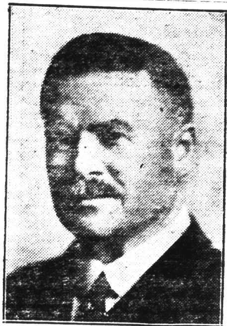
Hon. S. F. Tolmie Minister of Agriculture, who has made an arrangement with the Government and the Canadian Bankers Association to loan cattle raisers money to secure fodder, cattle being the security. Cattle raisers will thus be enabled to carry their stock instead of being forced to sell them at sacrifice prices.

The Marquis of Milford Haven was naturalized as a British subject, assumed the title of Prince Louis of Battenberg, and entered the royal navy as a naval cadet in 1868. He was successfully promoted from this grade to that of first sea lord of the Admiralty, from which position he resigned in 1914. In 1917, at the King's request, he relinquished his German titles and assumed by royal license, the surname of Mountbatten.