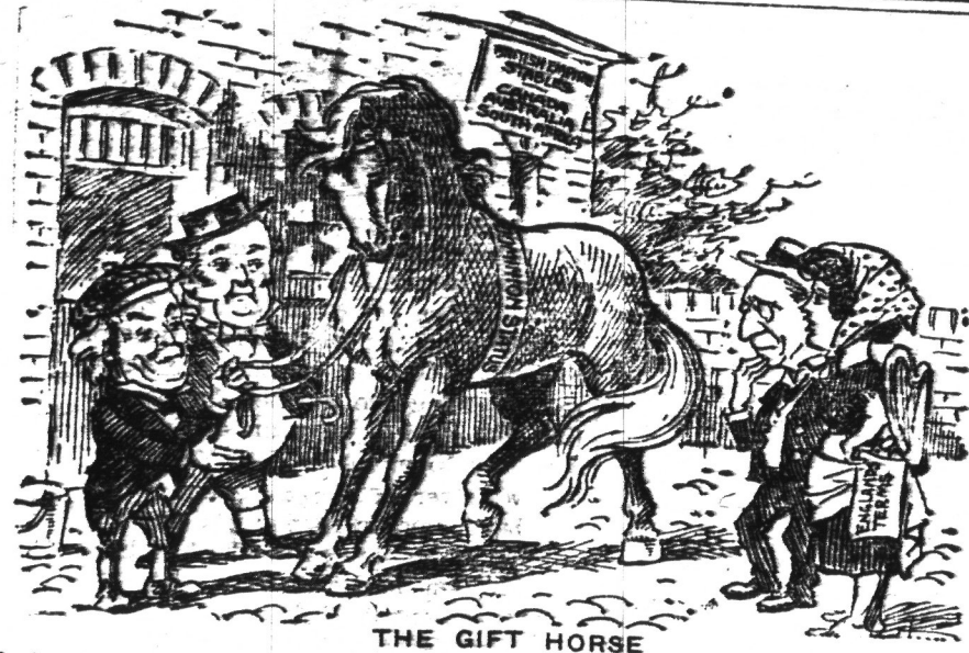
THE GIFT HORSE

"Irish freedom is coming, not because of any action of our enemies, but because of the strength of our own position. It is coming because of men who are still prepared to die for Ireland. We will not stop till Irish freedom is secured."