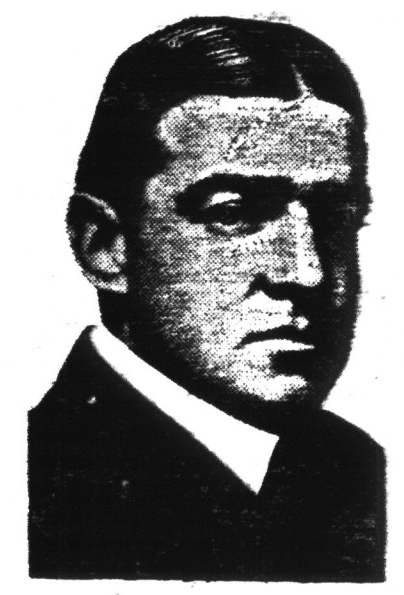
Sir Ernest Shackleton.

ship, Sir Ernest set sail from England last September on what was to have been a two-year voyage. Large crowds gathered on the docks in London to wish the party a successful voyage.