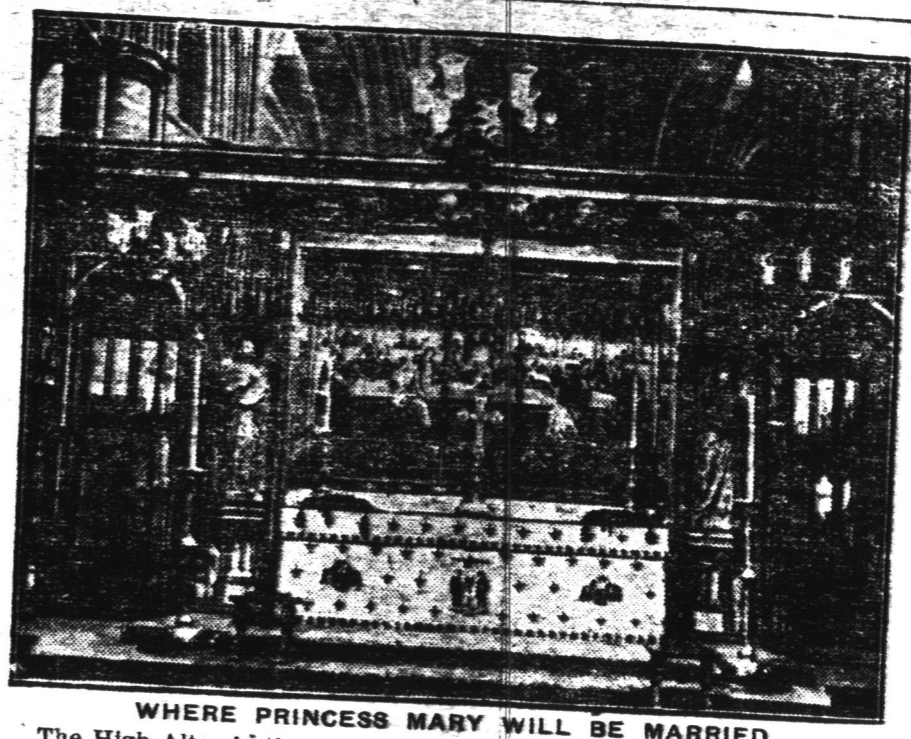
WHERE PRINCESS MARY WILL BE MARRIED The High Altar in the Sanctuary of Westminster Abbey, where the marriage ceremony will take place.

This attitude indicates clearly that the British War Office has laid complete plans to assume control with a stern hand unless there is immediately improvement in conditions. Reports reached London Friday night that the kidnapped prisoners had been removed further south, and that some have been sent to Dublin, showing that the kidnapers intend to hold their hostages indefinitely. Meanwhile Collins, from Dublin, has been using all means in his power to secure the release of the Ulsterites, but it is apparent that it will take many hours to reach all the points where the prisoners are secured.