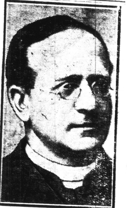
The New Pope, Pius XI. Cardinal Ratti, Archbishop of Milan, who was elected Pope on the seventh ballot of the Sacred College. He was only created a Cardinal last June, and is in his 65th year.

Clones is in that part of Ulster which is included in the Free State territory. It is very near the border. Belfast received its first intimation of the tragedy through a message to the station master at the Great Northern terminus, to the effect: "Send no more troops, regular police or specials by train." Then followed the news of the shooting and the casualty list. The Belfast police declare the specials were lined against a wall and mowed down.