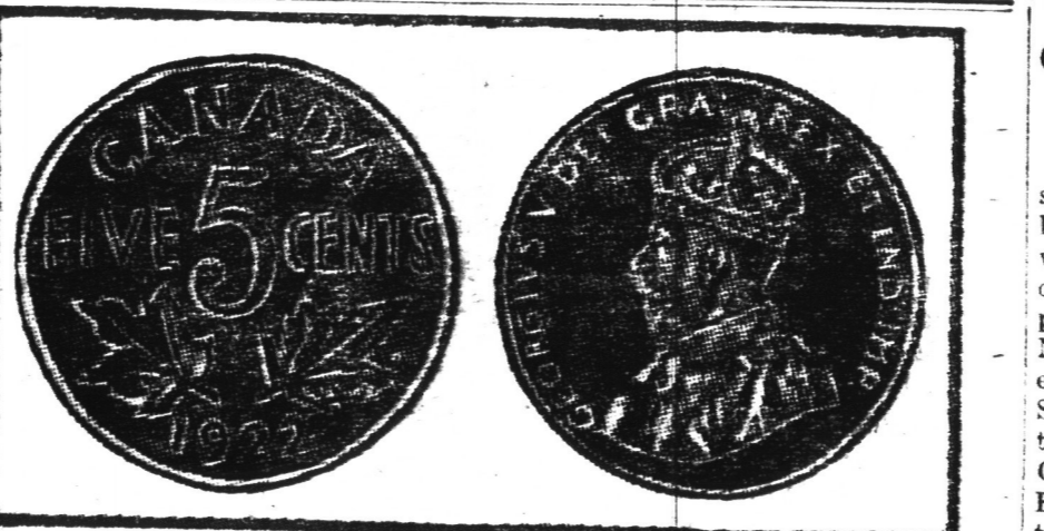
HERE'S THE NEW CANADIAN "NICKEL"

The Irish Free State is entitled to representation in the League of Nations.