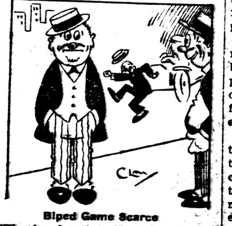
Biped Game Scarce "They're hunting lions in Central Africa with automobiles." "Is the supply of pedestrians getting low?"

Cholera Infantum is one of the fatal ailments of childhood. It is a trouble that comes on suddenly, especially during the summer months, and unless prompt action is taken the little one may soon be beyond aid. Baby's Own Tablets are an ideal medicine in warding off this trouble. They regulate the bowels and sweeten the stomach and thus prevent all the dreaded summer complaints. They are an absolutely safe medicine, being guaranteed by a government analyst to contain no opiates or narcotics or other harmful drugs. They cannot possibly do harm—they always do good. The Tablets are sold by medicine dealers or by mail at 25c a box from The Dr. Williams' Medicine Co., Brockville, Ont.