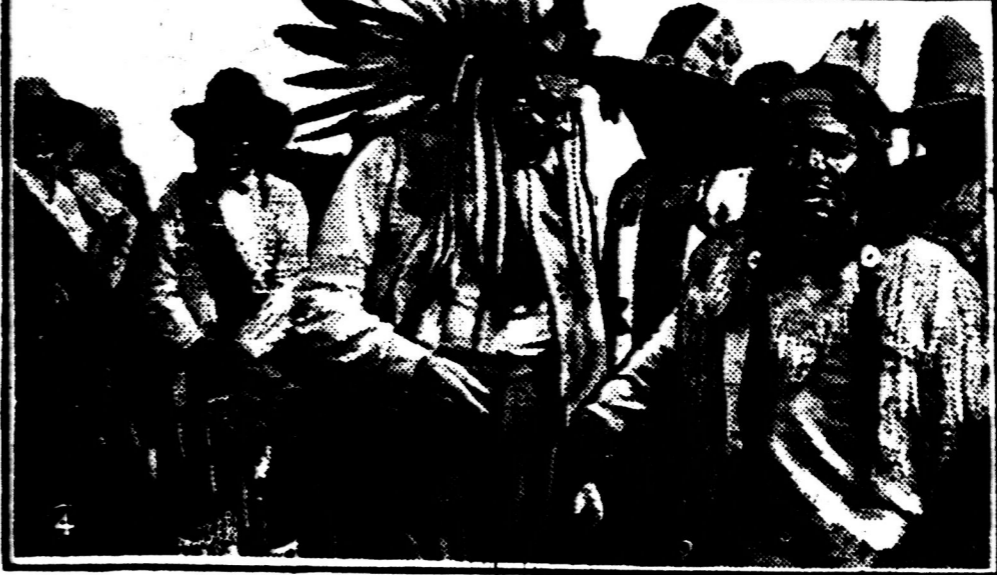
1. Indians, gaily caparisoned, await the judge's pleasure. 2. Lieutenant Governor Nichol smokes the pipe of peace—to the delight of the oldest members of the tribe (3). 4. Car-No-Sic-Klmeest and the Indian chief.

THE Indian, though reticent and undemonstrative, is ever ready to show his appreciation of the fact that the pale face is a friend, a brother to him. More often than not, he takes advantage of his fetedays to show this appreciation and good-will in simple ceremonies which honor the white man by bestowing upon him the name of one of their own, and a seat in their family and council circles.