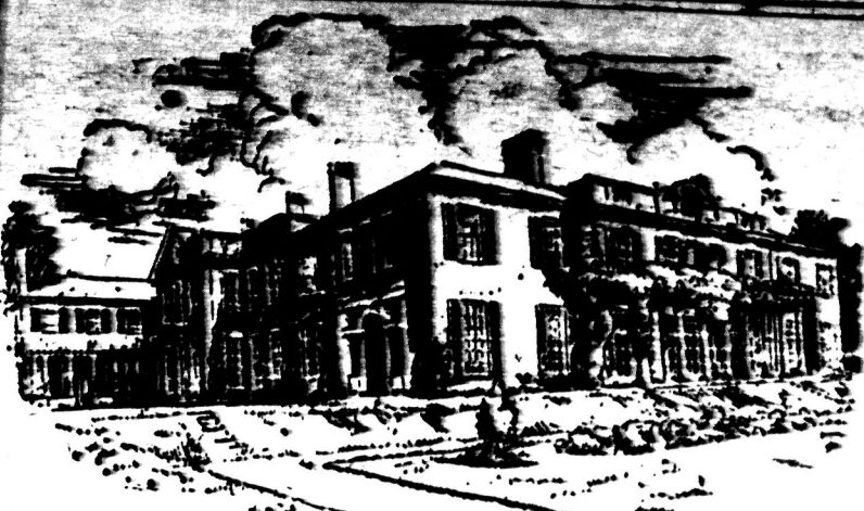
WHERE THE DUKE AND DUCHESS OF YORK SPENT THEIR HONEYMOON

Who's Safe? Old Mother Hubbard went to the cupboard To take just the tiniest swig; She heard a loud noise, Thought it only some boys-- But found 'twas a raid by the League.