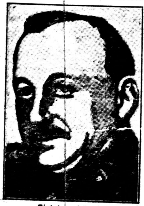
Dictator of Spain. Primo Rivera, who has placed himself at the head of the new military government of Spain. He has abolished trial by jury.