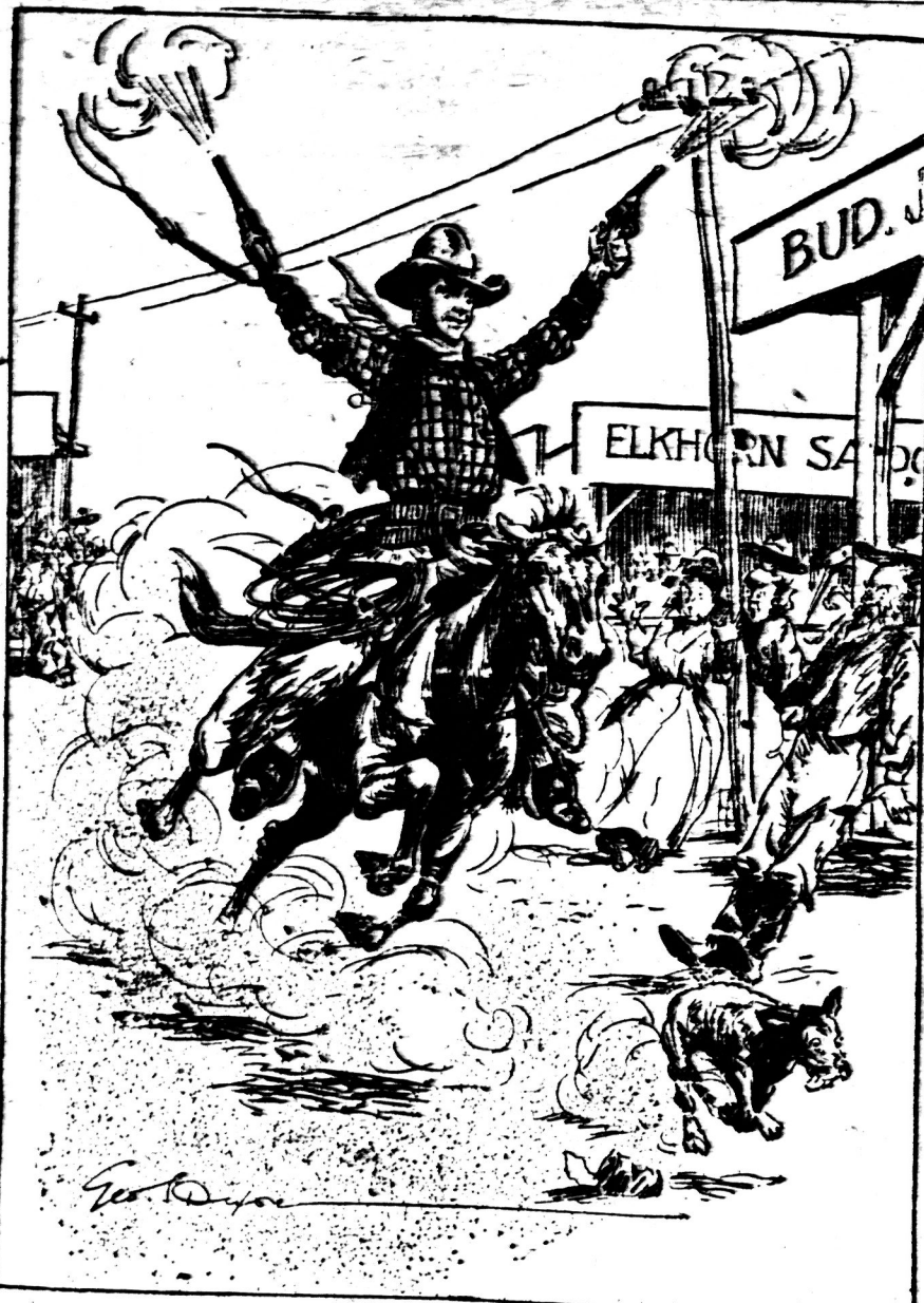
IN THE WILD AND WOOLLY His Royal Highness did not succumb to environment. —From London Opinion.