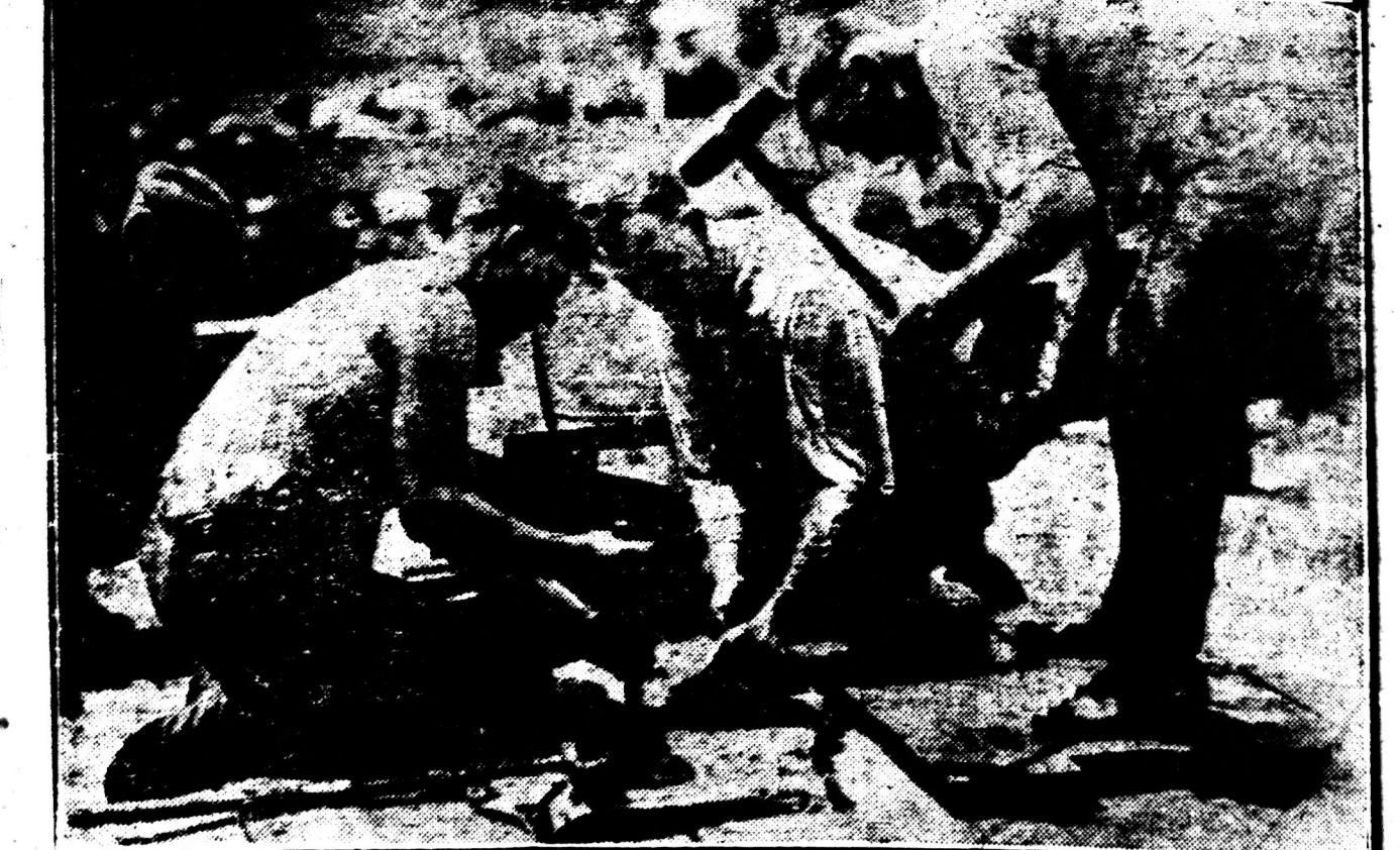
Competitors are shown in the hand-drilling contest at Cobalt, which was one of the many features of the Old Boys Reunion held in the northern mining towns recently.

A disabled soldier had been so long in one hospital that it seemed like home and he was anxious to impress his notes on all callers. "Why," he exclaimed, "it's the most complete in the country. They have an eye specialist, a throat specialist, a nose specialist, and they even have internes for internal diseases."