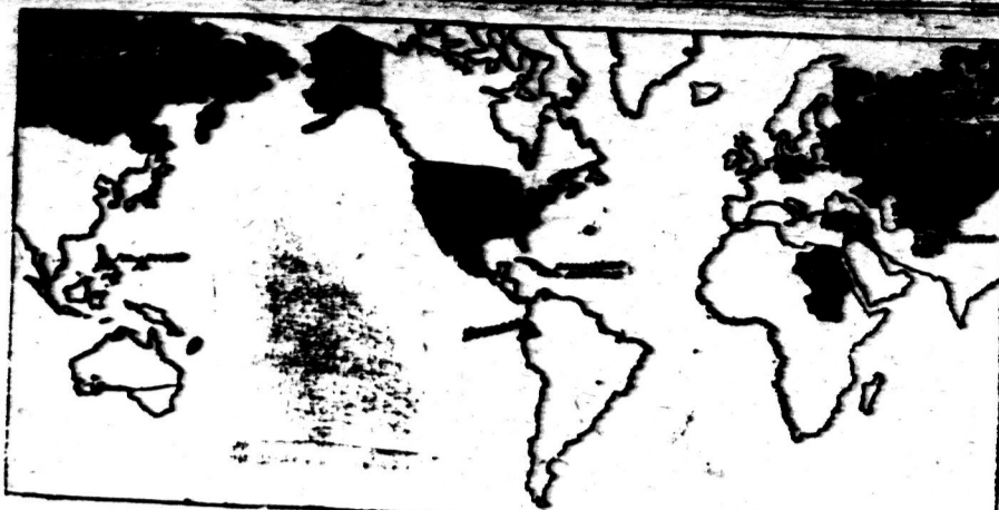
The white spaces in the above map, made for the Christian Science Monitor, represent the nations that are League members. The black portions represent the nations that are outside the League, namely: Russia, Afghanistan, Turkey, Egypt, Germany, Ecuador, Dominican Republic, Mexico and the United States.