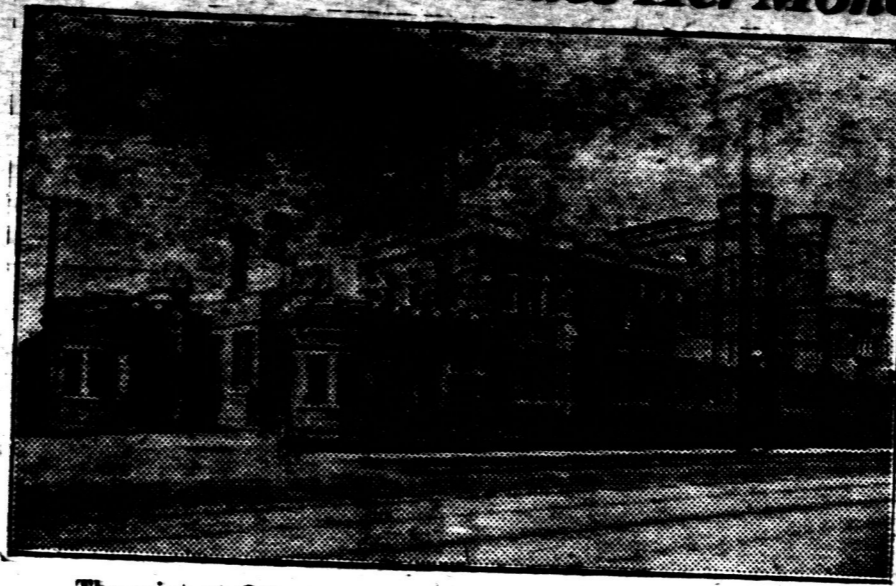
The mint at Ottawa, one of the few similar institutions in the Empire, where all Canadian coinage is made, and where some British sovereigns are also coined. Since 1871 Canada has had a standard currency for the entire Dominion, but the mint was erected only in 1908.