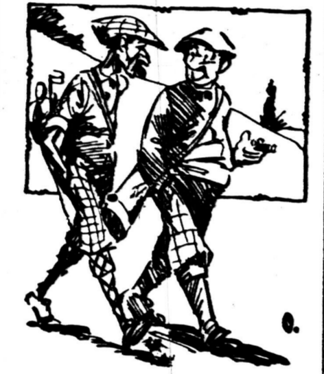
Where He Falls Down. "Hicks is a fellow who is wonderfully accurate at figures." "Say! You've never played golf with him, have you?"

The tones were clear and natural as they reached the thousands of sets that were in readiness to test the experiment. The nightingales in distant Oxford had brightened for a few minutes the urbanite's life—and, incidentally, the radio program.