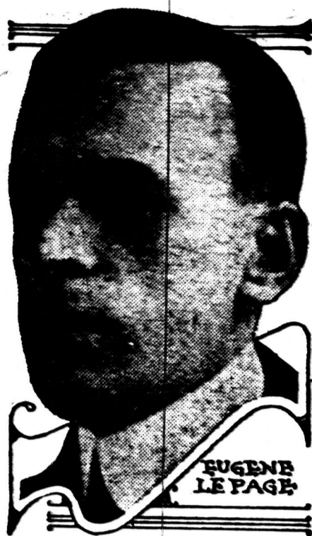
Tanlac Vegetable Pills For Constipation. Made and Recommended by the Manufacturers of Tanlac.

Tanlac is for sale by all good druggists. Accept no substitute. Over 40 million bottles sold.