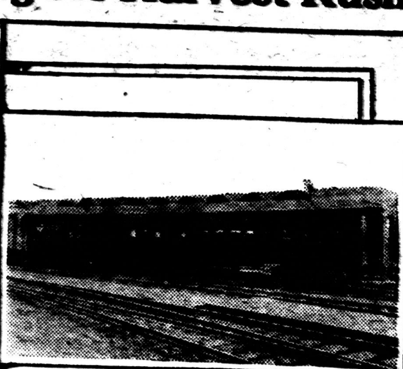
A number of steel Colonist cars as the one above forms part of the equipment of most trains.