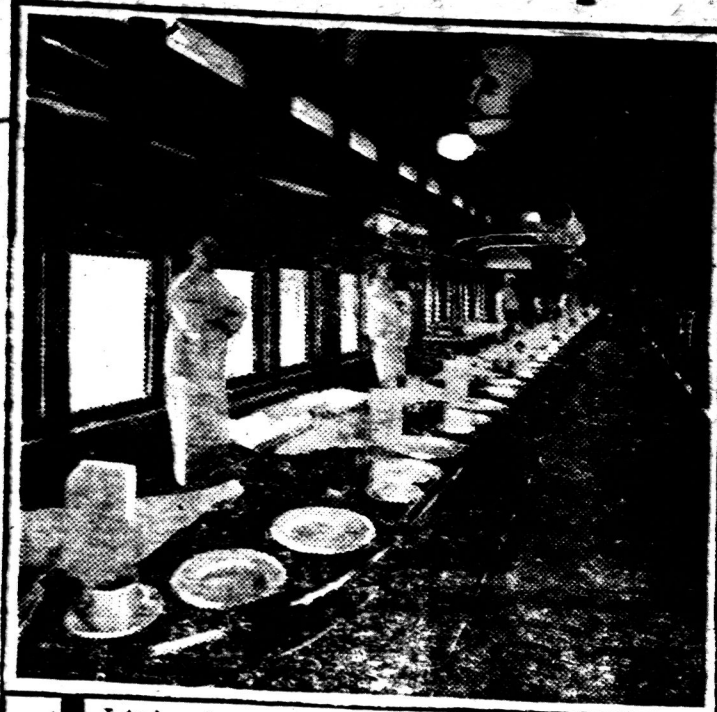
Interior view of one of the new lunch counter cars operated on Canadian Pacific lines.