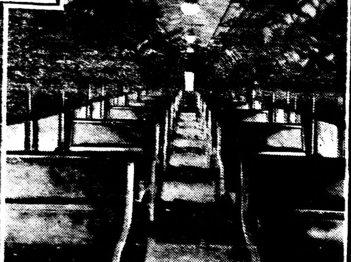
Interior view of Colonist car used on harvesters' trains.

Cutting of all wheat is expected to begin within about a week, says a report of the Ontario Department of Agriculture, and as a rule fall wheat is looking very promising. Western reports are also very encouraging, but just what the harvest is expected to be will not be generally known until representatives of the three prairie Provincial Governments and the two railroads meet in Winnipeg to discuss the labor situation and the best means of securing help to harvest whatever crop there is. However, the crop reports issued to date by the Agricultural Department of the Canadian Pacific Railway have been very optimistic and this company is already gathering and distributing equipment to various points in anticipation of a heavy movement of harvest workers.