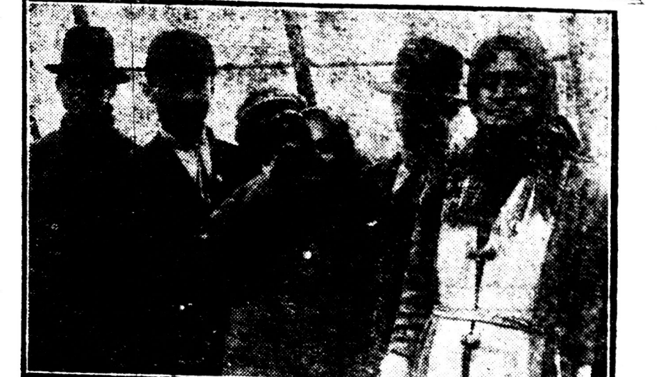
With the shores of Canada in sight these Russian immigrants are in high spirits and one lady takes a drink to celebrate it.