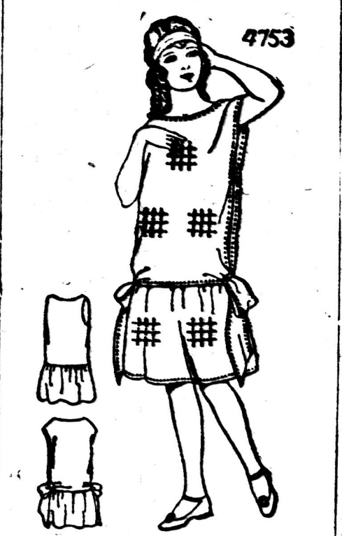
A PLEASING FROCK FOR MOTHER'S GIRL.

CHAPTER XXI.—(Cont'd.) "And how could Hugo have blackmailed Mrs. Egan?" Gaunt demanded. "Perhaps she's afraid that he's still mad and might do her an injury if she refused," Jean said. "You see, he—he killed her husband. Probably Mrs. Egan, more than anybody else in the world realizes what Hugo is capable of." Gaunt pursed his lips. "That's not altogether likely. No doubt the money was owing to him, as he said. It's the simplest explanation, and in my experience one need not search for the obscure." "You think you can use it—honestly?" "Of course you can, my dear. But there's one thing—Gaunt bent over and knocked the bowl of his pipe against his boot. "This matter of a dowry for Alice. I—hang it all!—am I to do nothing, give nothing? Am I to stare and—" "Oh, Hector! Please don't make it difficult." "It's you who made it difficult in the first place. You—my wife—" "Hector, you mustn't say such things." "Did we not stand in church together and pledge ourselves to be man and wife?" "Hector, you know how things went; that I wasn't really your wife." He went on as though he had not heard. "And I loved you then; I love you now. Perhaps you think it's easy for me to stand aside always. I've a good mind to reach out my hand and take you. You belong to me. Why shouldn't I?" "Oh, please—please don't say any more." Hugo's head popped out of the dining room door. He might have heard every word they said. "I'm ready," he piped.